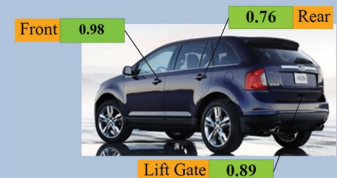
PRECISE MEASUREMENTS EVERY TIME