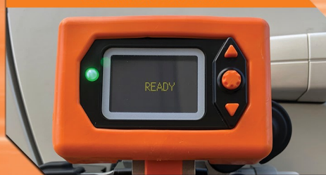
GREEN/RED LED DISPLAY