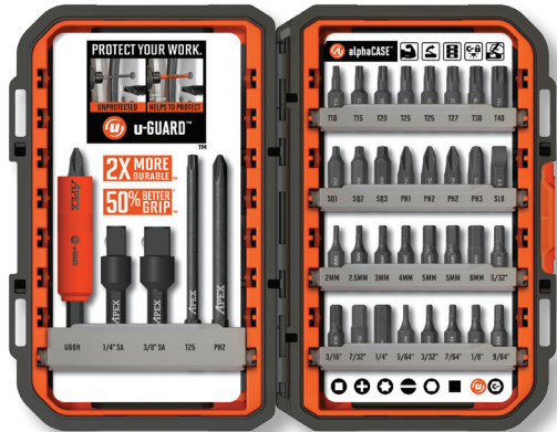
AUGSET-38 | 38 Piece u-GUARD™ Fastening Set