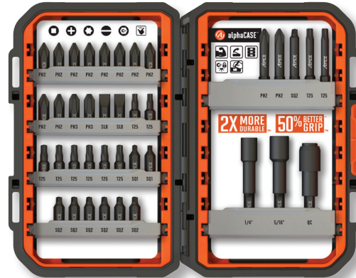
AMSET-38 | 38 Piece Fastening Set