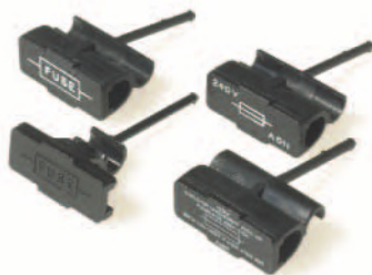
MS-3 Printed Fuse Carriers