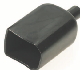
PVC Insulating Cover

The CLIFF MS-3 series Power Input Connectors are produced from heat resistant plastic with solid brass nickel-plated metal parts. Parts for soldering are tin plated. The MS-3 is a composite design incorporating an input, fuseholder and voltage selector. The fuse carrier is available printed with various voltage combinations. Two terminal options are available – Solder Tag and Quick Connect. All products are produced in accordance to IEC320 / EN60-320 and have various safety approvals. The standard colour is Black, however some products are available in other colours, subject to a reasonable order quantity. For voltage selector options, refer to drawing number CL19262. Supplied without fuse fitted.